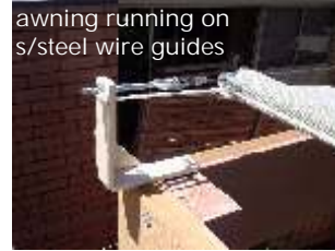
awning running on s/steel wire guides