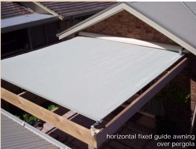
horizontal fixed guide awning over pergola