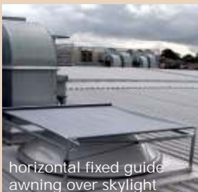
horizontal fixed guide awning over skylight

quoting jobs has its own little everyday's rewards