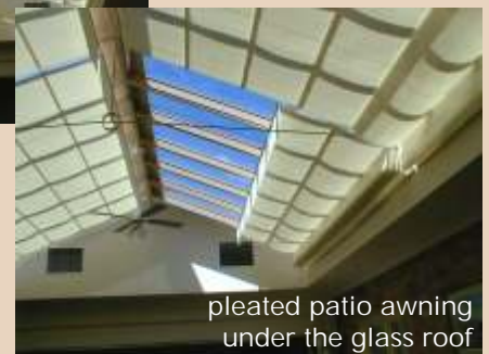
pleated patio awning under the glass roof