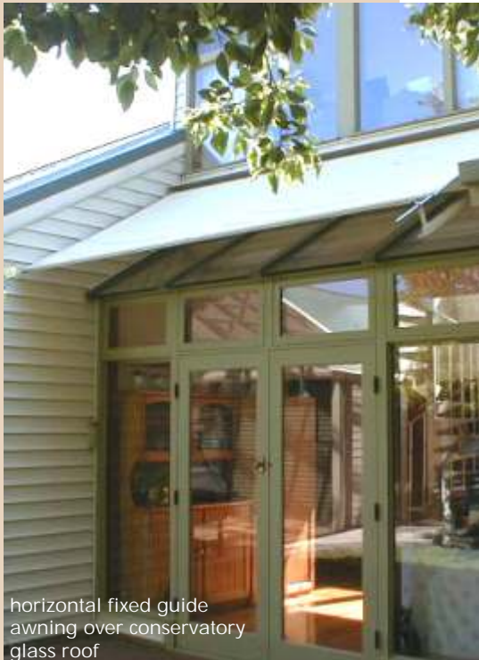
horizontal fixed guide awning over conservatory glass roof

Economical choice for covering hard-to-reach glass and laser light roofed pergolas or pergolas overgrown with climbing plants as this design is installed above the existing roof.