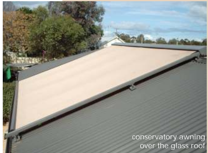
conservatory awning over the glass roof

Pleated patio Awning is one of the systems available in both manual or motorised operation. This unique retractable awning system can be installed under an existing pergola or glass covered roof without any expensive alterations.