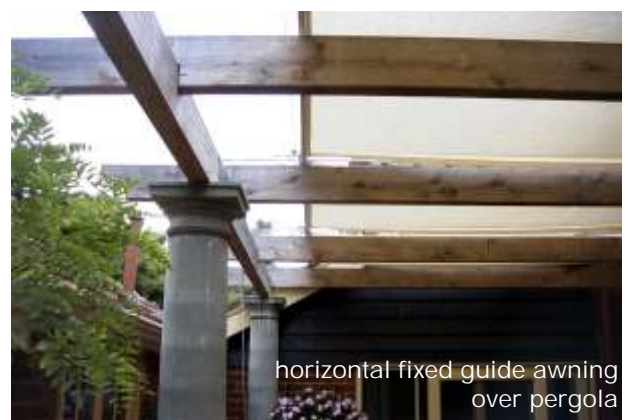
horizontal fixed guide awning over pergola