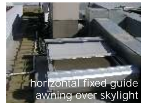
horizontal fixed guide awning over skylight