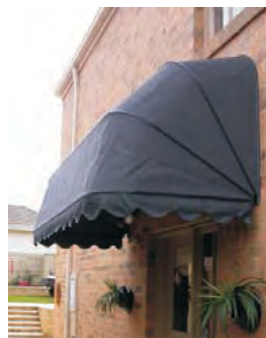
Acrylic Canvas Scalloped Valance