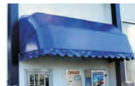
PVC fabric Scalloped Valance