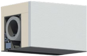
HMX 100/R Recessed installation