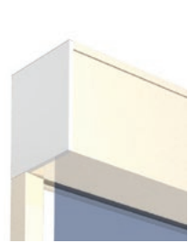
HMX 100 100 x 120mm