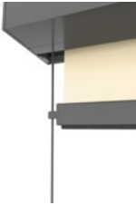
Side guide cable